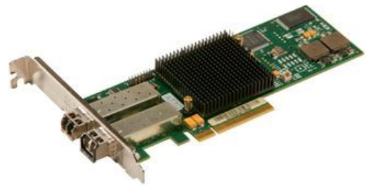
ATTO Celerity FC-82EN