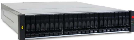
AssuredSAN 3920 / 3720