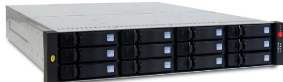
AssuredSAN 3930 / 3730